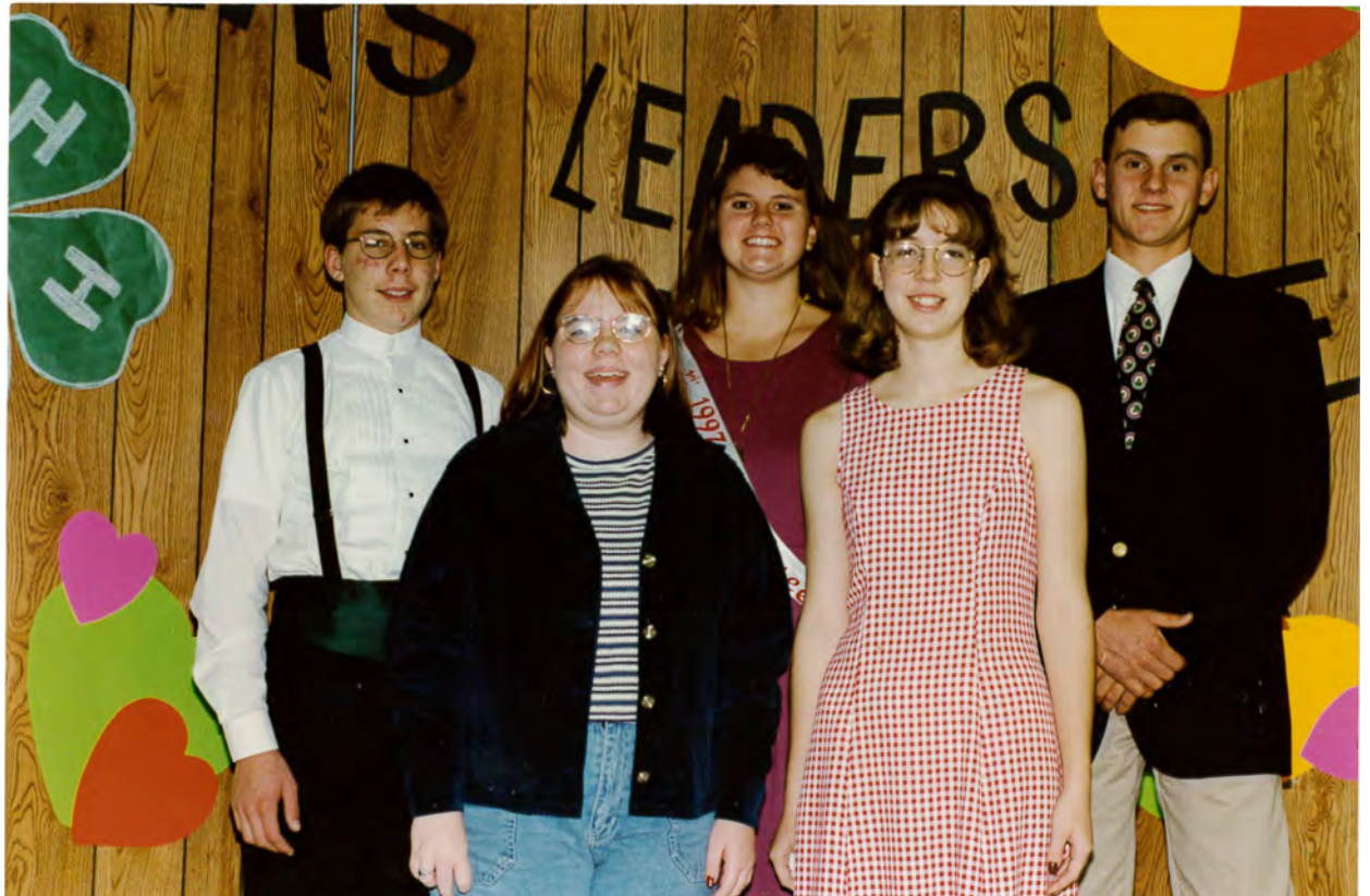
1997 Achievement Banquet