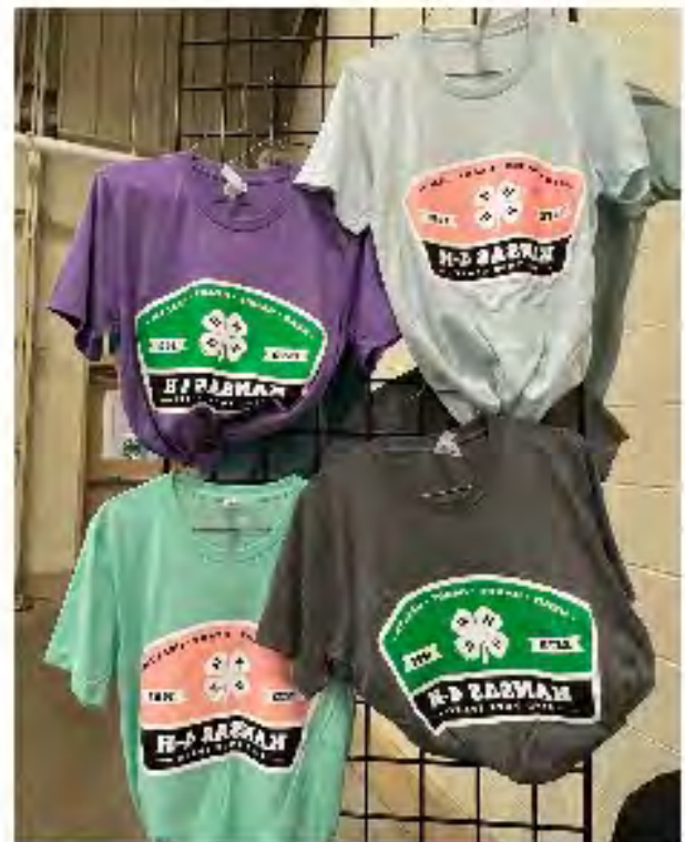
Adult Shirt Colors

https://www.companycasuals.com/4HSParkTees