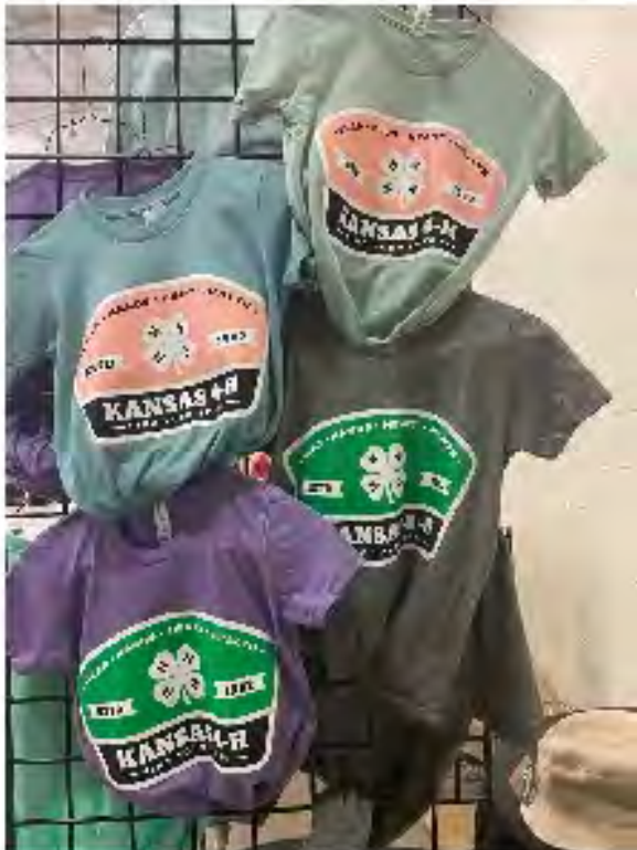
Youth Shirt Colors